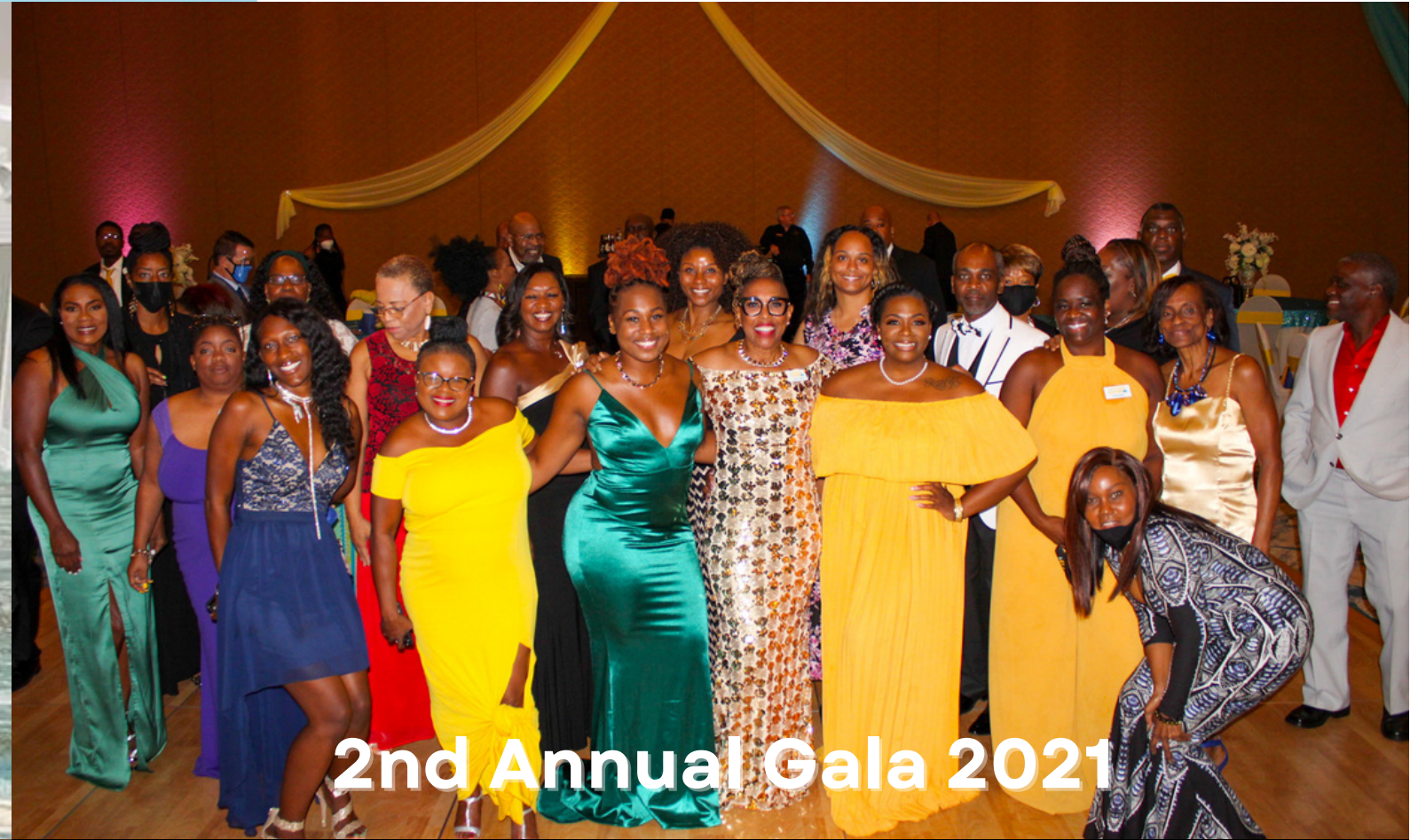
2nd Annual Gala 2021