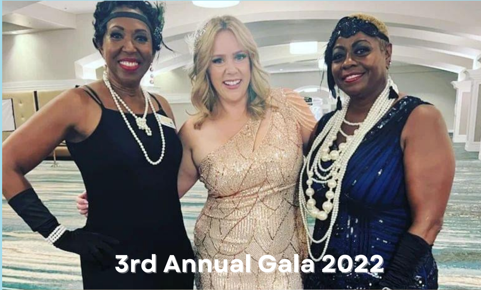
3rd Annual Gala 2022