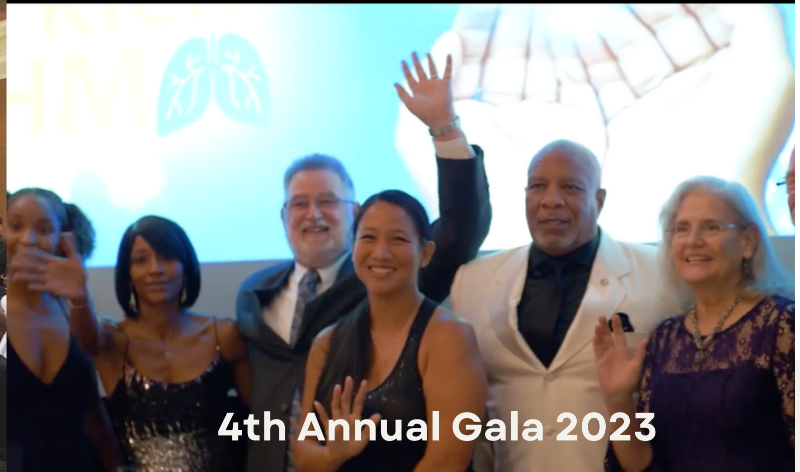
4th Annual Gala 2023