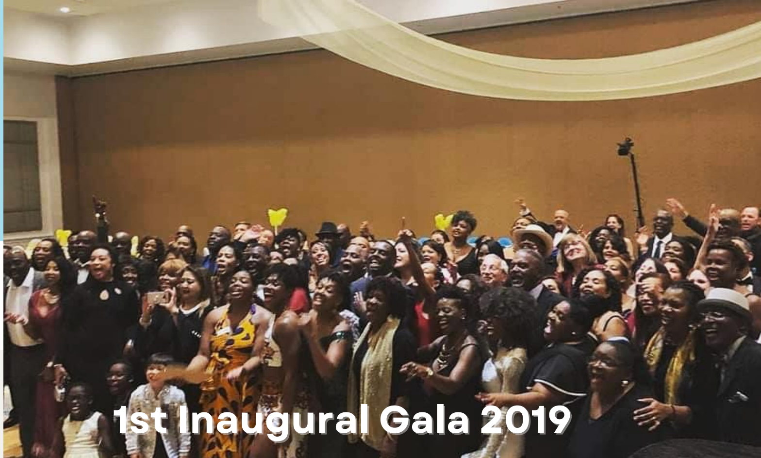
1st Inaugural Gala 2019